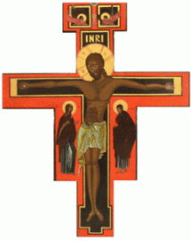
Sunday of the Life-Giving Cross